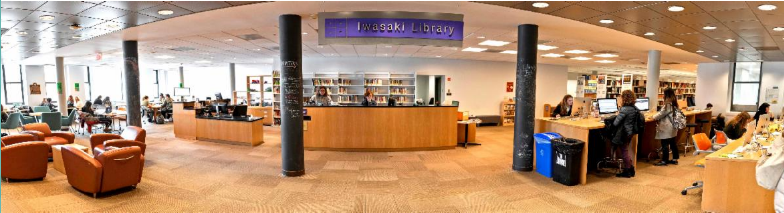
Iwasaki Library at Emerson College