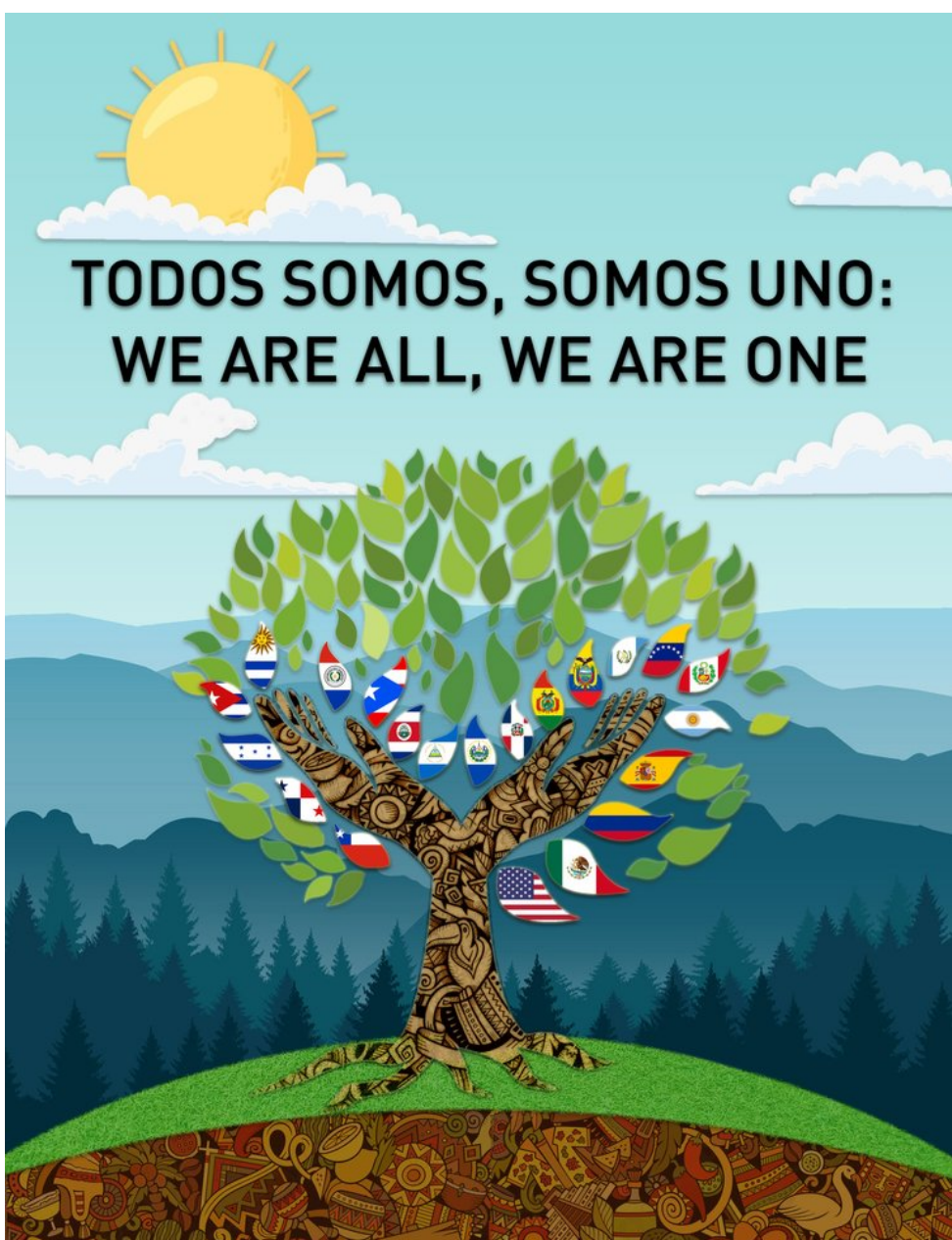
Pfyer for National Hispanic Heritage Month that reads "Todos somos, somos uno: We are all, we are one."

Celebrate National Hispanic Heritage Month at the Library!