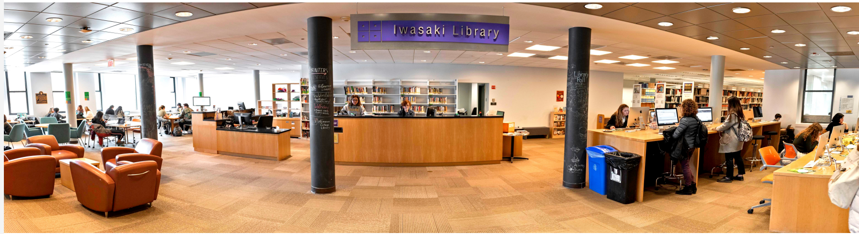
The Iwasaki Library at Emerson College